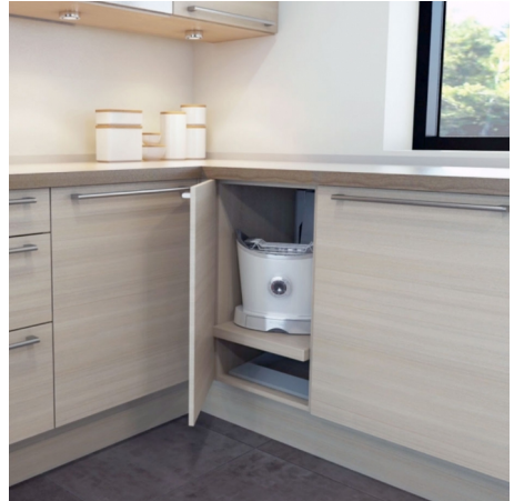
Unilift inside the cabinet.

The lift moves quickly but quietly and comes up to a comfortable working height, without strain on the user. The lift is operated by a manual control unit that can be located wherever required and secured in place by means of Velcro tape discs.