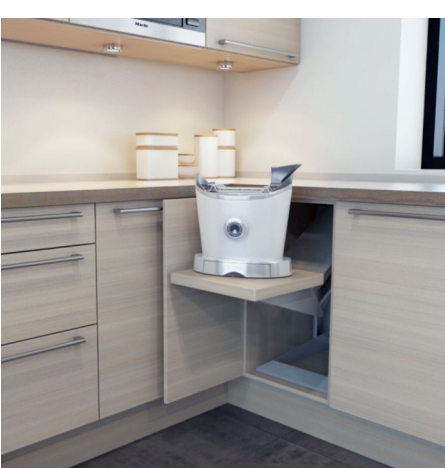
You can stop the height adjustment when the height suits you.